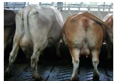
Size differences within a herd