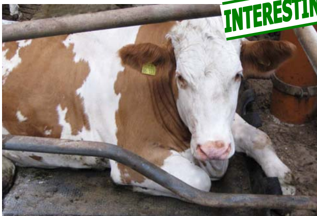
Cow lies relaxed with foreleg stretched-out in the cubicle and ruminates