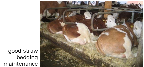
good straw bedding maintenance