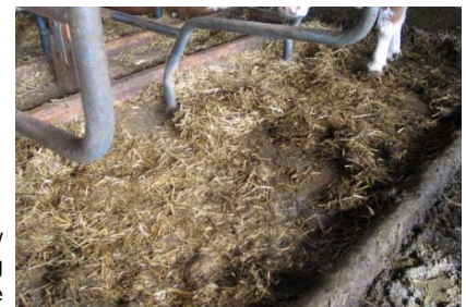
bad straw bedding maintenance