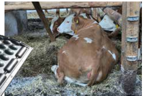
POLSTA is installed in the head space of the deep litter cubicle