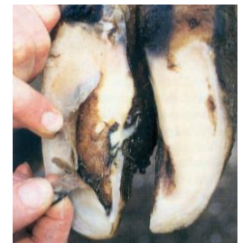
A double sole, caused by laminitis.