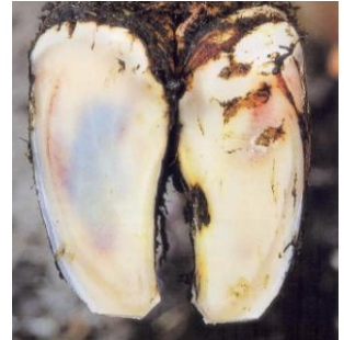
Yellowish red spots in the sole area are typical symptoms of laminitis

Subclinical laminitis is the most frequent laminitis form in dairy cattle . The animals affected show no lameness, but at claw trimming yellowish bloody inclusions appear within the horn. Through the changes in the corium only horn of lower quality can be produced.