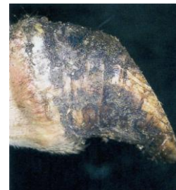
The dorsal wall is bent, a typical symptom of laminitis.