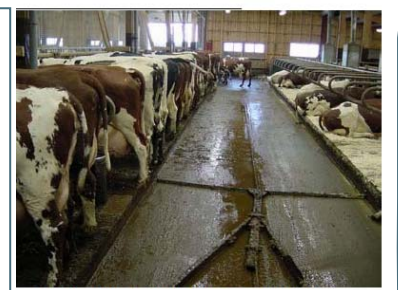
left: feed stalls

feed stall with rubber cover for soft and hygienic standing during feed intake